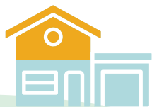
interior (upper level)